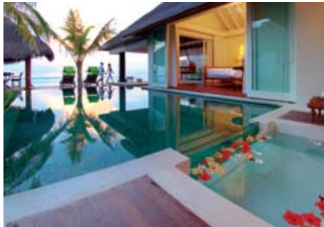
Naladhu Ocean House