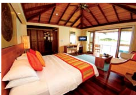
Over Water Bungalow