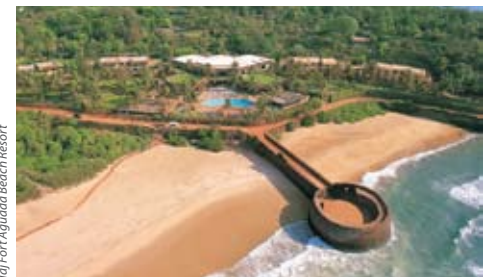
Taj Fort Aguada Beach Resort

Built on the ramparts of a 16th century Portuguese fortress, this resort is part of a sprawling 73-acre complex overlooking the Arabian Sea. Fort Aguada Beach Resort offers a range of spacious villas and cottages. With its exotic tropical beauty, pristine beaches, nine restaurants, Jiva Spa, and vibrant local culture, guests can discover many opportunities for fun. The Resort offers many activities from adventure mountaineering to tennis and squash.