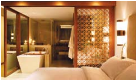
Alila Diwa Goa