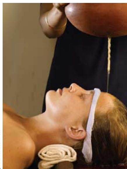
Spa and Meditation in Goa