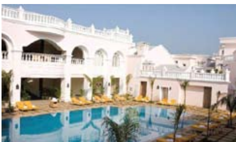
The Retreat by Zuri