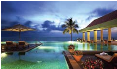
The Leela Kempinski, Goa