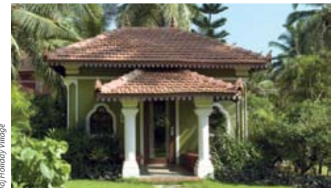
Taj Holiday Village

The Taj Holiday Village, Goa celebrates 25 glorious years with a fresh new look. With entirely new landscaping and lobby, renovated cottages and restaurants, a sparkling new island bar, the Spa and a range of exciting indoor and outdoor recreational options, this beach resort now exudes a fresh feel and look. The perfect combination of modern elegance and Goan – Portuguese architecture, the resort is a picture-postcard hamlet fringing the beach.