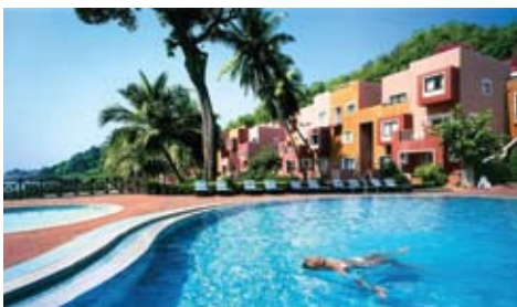
Cidade de Goa