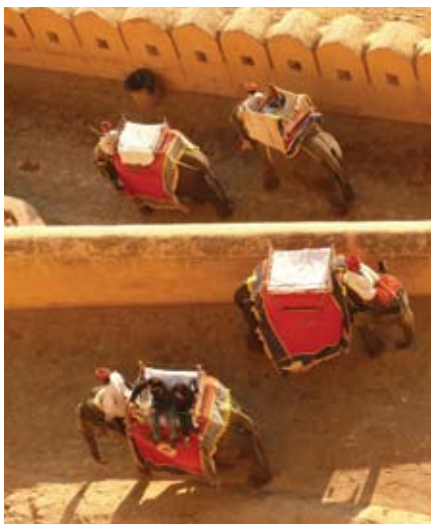
Elephant Ride, Amber Fort

After breakfast, you will be driven just outside Jaipur to the ancient capital of Amber where an elephant (or alternatively a jeep) will carry you up to the 17th century Amber Fort. In the afternoon you will visit the City Palace in the heart of the old city, and the extremely intricate 'Palace of Winds', also known as 'The Hawa Mahal' as well as the Jantar Mantar Astronomical Observatory. There are some local markets nearby which you may have time to visit before returning to your hotel. Overnight at your HOTEL. (B)