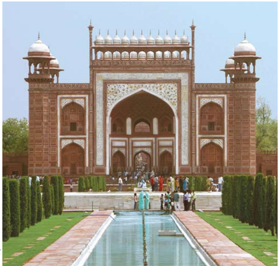
Red Fort, Agra