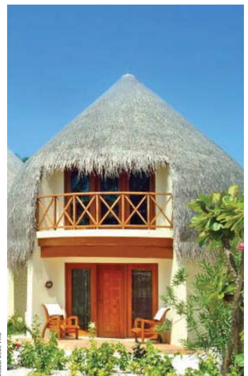
Jacuzzi Beach Villa