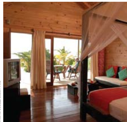
Interior Jacuzzi Beach Villa

Meeru Island Resort, surrounded by a beautiful lagoon and long stretches of white, sandy beach, is the only resort on the island of Meerufenfushi. 286 Rooms include 20 Garden Rooms, 77 Beach Villas, 83 Jacuzzi Beach Villas, 27 Water Villas, 77 Jacuzzi Water Villas, and 2 Honeymoon Suites. All rooms feature tropical décor, a king size or two twin beds, private patio, air-conditioning, overhead ceiling fan, stocked mini bar with refrigerator, IDD telephone, color cable TV, personal safe, bathroom with hot water, shower, bath accessories, hair dryer, and nightly turndown service. Also provided is complimentary use of chaise lounges at the pool and beach and beach towels.