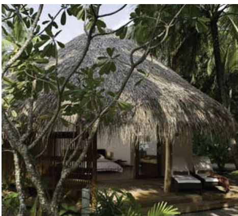
Superior Beach Villa with Jacuzzi

* Price excludes Christmas and New Year supplement