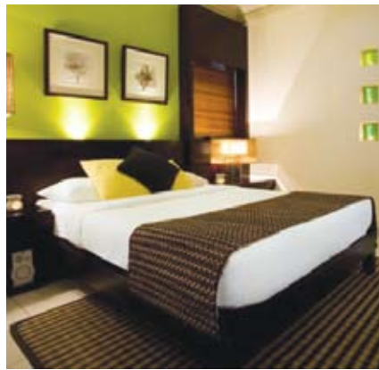
Beachfront Villa Bedroom

The 45 villas spread across the circumference of the coral island open directly onto the beach to breathtaking views of shimmering turquoise ocean. All villas are furnished with thatched roofs, private gardens and a minimalist-influenced interior in vivid lime green, tangerine and yellow; where 20 of the villas are equipped with open-air jet pools.