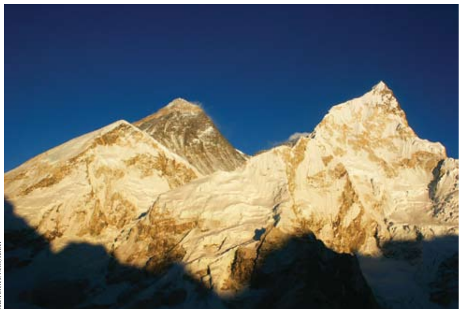
Mount Everest views, sunset