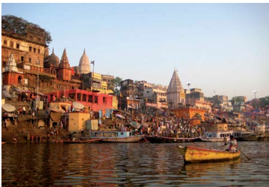
River Ganges at sunrise