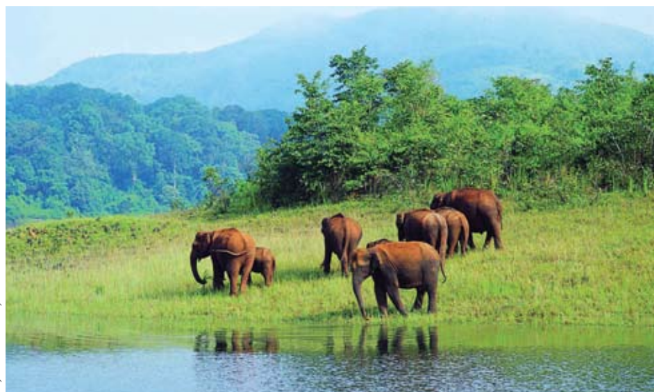
Periyar Wildlife Sanctuary