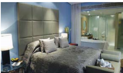
The Park Chennai