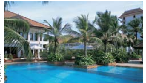
Taj Mahal, Mumbai

The Taj Mahal is an architectural marvel and a landmark of Mumbai. Since it opened in 1903, it has created its own unique history. It offers panoramic views of the Arabian Sea and Gateway of India, and has amassed a diverse collection of paintings over the last century and is decorated with a diversity second to none from Belgian chandeliers to Goan Christian artifacts, the hotel incorporates a myriad of artistic styles and tastes.