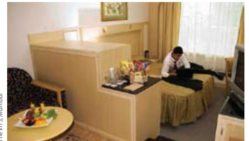
The VITS, Mumbai

The VITS, Mumbai is located in the heart of Mumbai's new commercial center and in close proximity to the International airport in Mumbai. Rooms are a contemporary mix of eco-friendly with all modern amenities and conveniences for the business traveler or leisure traveller. Amenities include wi-fi internet service in each room, 24 hour food service, in room security boxes, DD telephone and multichannel flat LCD TV.