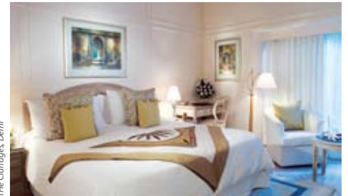
The Claridges, Delhi

Located in the heart of Delhi, The Claridges has been a landmark since the 1950's and is the flagship property of The Claridges Hotels & Resorts Group. Set on 3 acres, the hotel is close to the business district, ministries, diplomatic missions, shopping, cultural and historical areas. The rooms are among the most spacious in Delhi, and are a blend of the classic and contemporary styles.