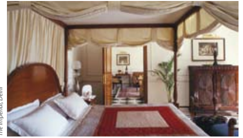
The Imperial, Delhi

The Imperial is one of Asia's finest hotels, and was built as an ode to India's independence. The 1930's Victorian style building is located in Janpath, only steps from the shopping district and just half an hour's drive from the International Airport. Each breathtakingly designed suite has a distinctive interior and overlooks the lush, verdant gardens.