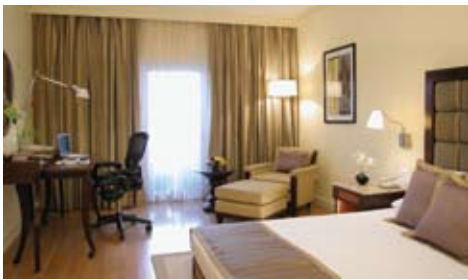
Taj Residency - Bangalore - Guest Room