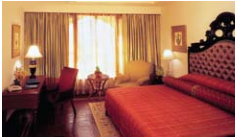
Taj Krishna - Taj/Club Room