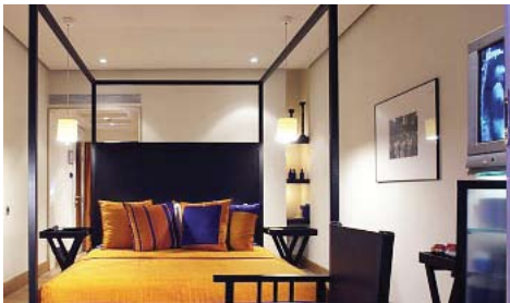
The Park Bangalore