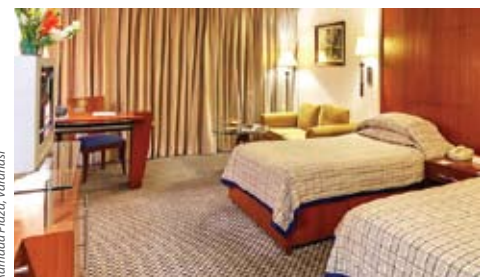
Ramada Plaza, Varanasi

Ramada Plaza overlooks the Varuna River in Varanasi and offers 120 guest rooms with contemporary and stylish décor. All guest rooms feature a view of the garden or the swimming pool and marble bathrooms with a deep soaking bathtub. Hotel amenities include swimming pool, business center, elevator, and ice vending machines. All rooms include TVs, hairdryers, mini bars, internet, and safes.