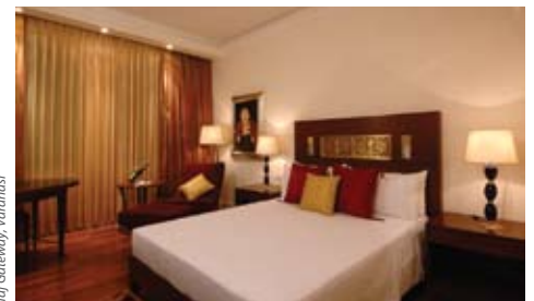
Taj Gateway, Varanasi

The Taj Gateway Hotel, situated on the banks of the Varuna River, offers a unique and convenient opportunity to explore Varanasi (known as the City of Temples) by water. The hotel offers 133 beautiful, fully air-conditioned rooms with all the modern conveniences. Hotel facilities include the Mandap and Vasuna restaurants, the Prinsep Bar, meeting rooms, business center, swimming pool and fitness centre.