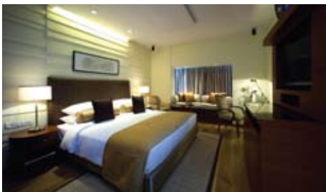
Taj Coromandel - Luxury Room