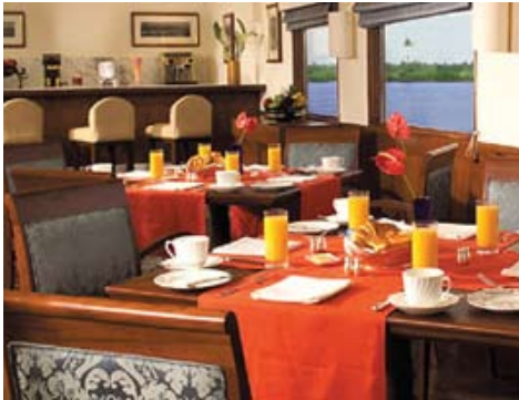
Dining on the M.V. Virinda

Accentuate your South India holiday experience aboard one of the famed Kettuvallams (houseboats) of Kerala. Cruise the intricate network of palm fringed canals, lakes and lagoons, in "the Venice of the East", and experience the rural and real life in the heart of "God's Own Country".