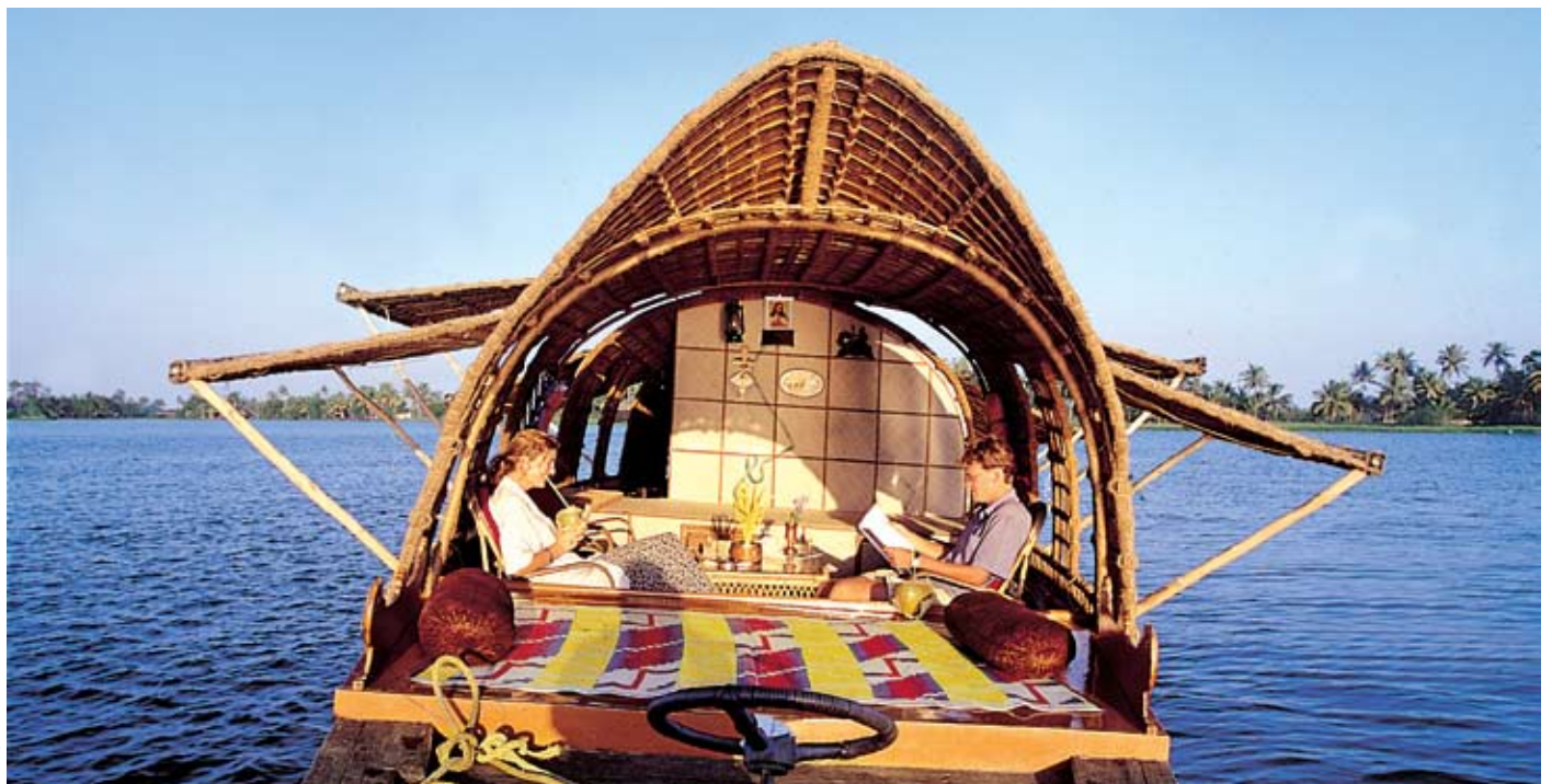
Cruising the backwaters of Kerala