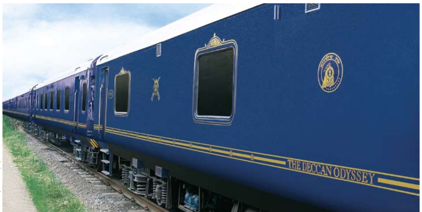
Indian Maharaja - Deccan Odyssey