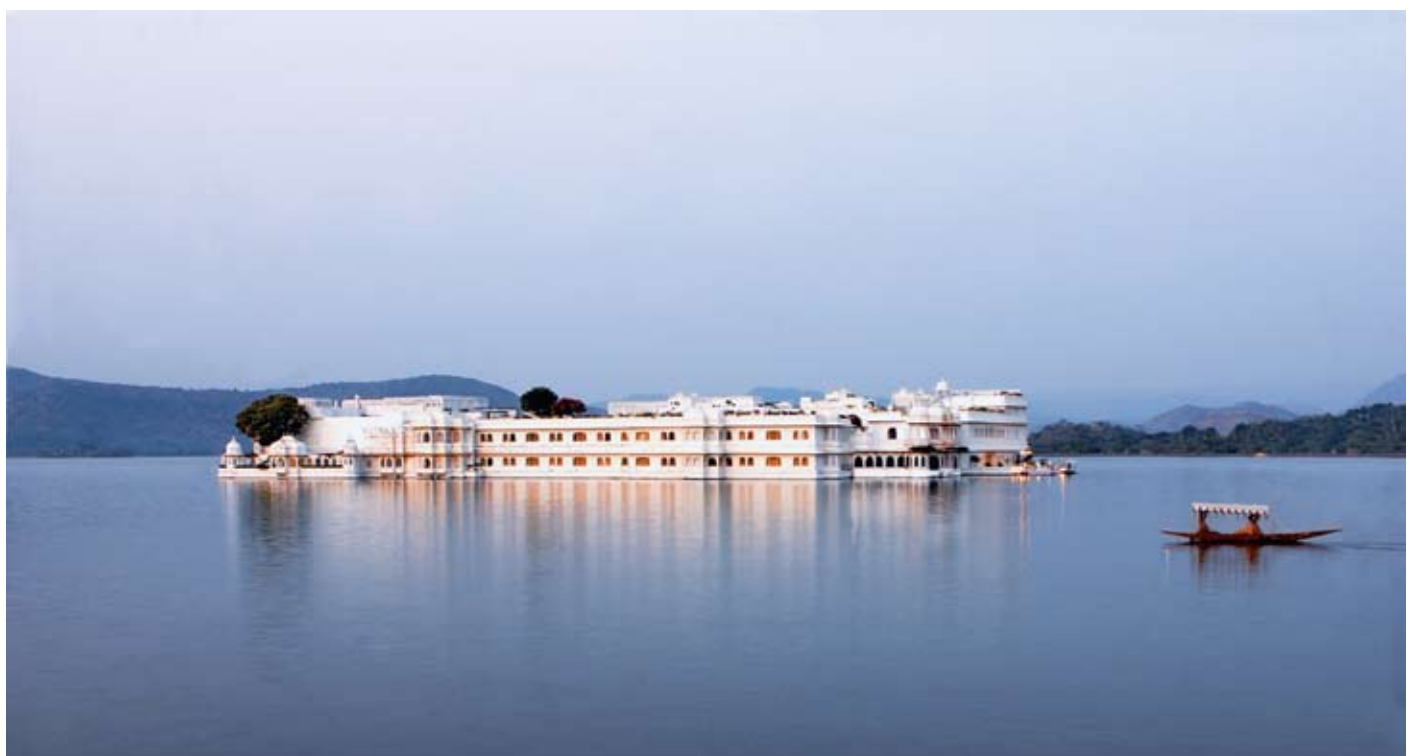
Taj Lake Palace, Udaipur